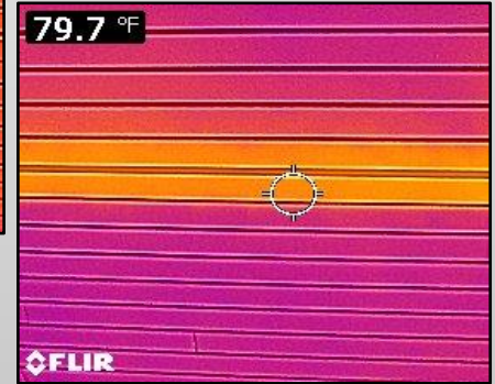
Heating vice Cooling

Immediate need - Heating, Ventilation and Air Conditioning is no longer working as designed